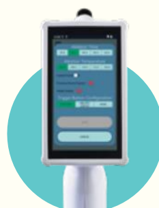
User adjustable settings for time and temperature of treatment cycle

Liger strives to be cutting edge. Future projects include cloud based storage and AI for automated visual evaluation of the cervix. All IRIS devices will be able to receive updates when connected to wifi.