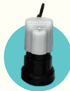
4 hours of use per charge