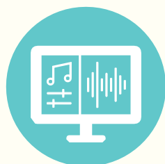
Audio and visual safety cues.