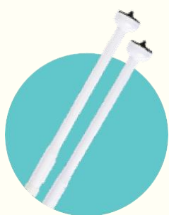
Heated probe tip